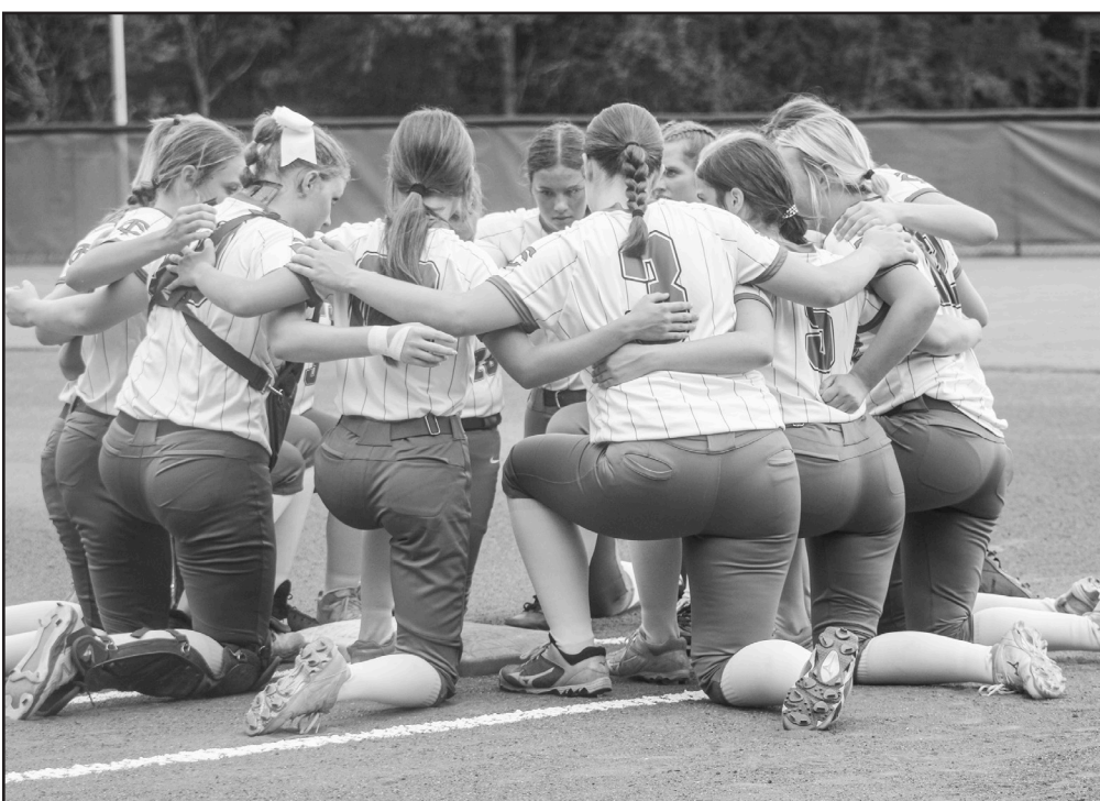
Towns County delivered a 16-1 rout vs. Chestatee on Aug. 23.

ingston. Rogers scored the final run on Fain's RBI, concluding the game at a score of 16-1.