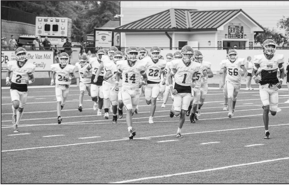
The Indians take the field last Friday night in Greensboro.

LOA went up top for its third touchdown pass during the third quarter, bringing the